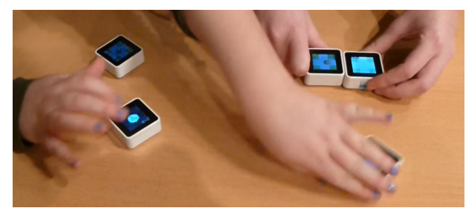
Figure 3. A complex situation for players using the best strategy: the player on the left simultaneously breaks an ice cube (with her right hand) and slides a free cube toward the second player (with her left hand). The player on the right of the picture keeps the hamster alive.

Unexpected behaviors: As we have shown above, our players developed numerous gameplay strategies, some of which were hard to predict when designing the game. First, some players did not keep the cube in hand while tilting it, but simply left it on the table, lying on its side. This behavior is very efficient, and only a few players discovered it. But as soon as one player did, every other player started using it too. Also, players tried to play with the cubes in the air, away from the