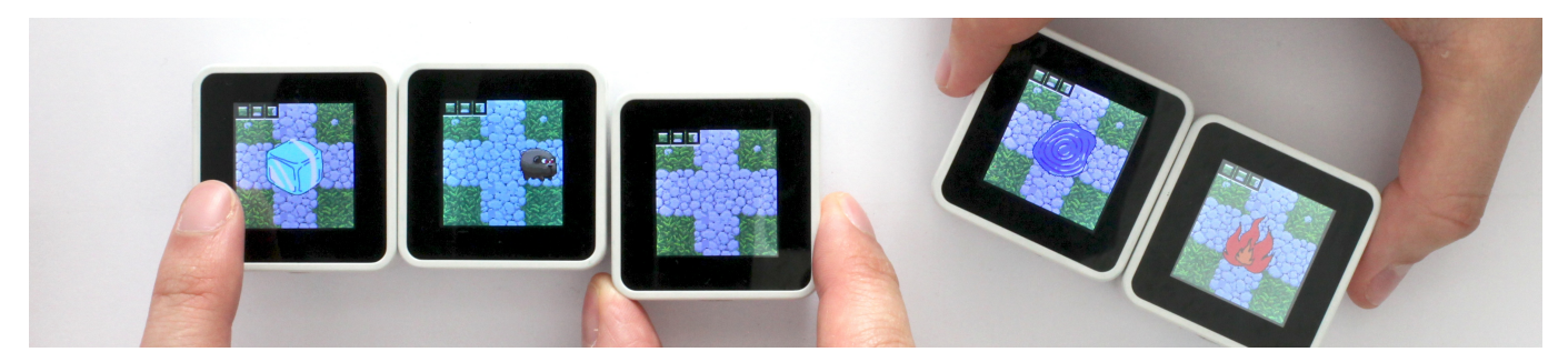
Figure 1. Fat and Furious is a collaborative tangible video game running on Sifteo Cubes.

Conservatoire National des Arts et Métiers - CEDRIC & ENJMIN 292 rue Saint Martin, Paris, France